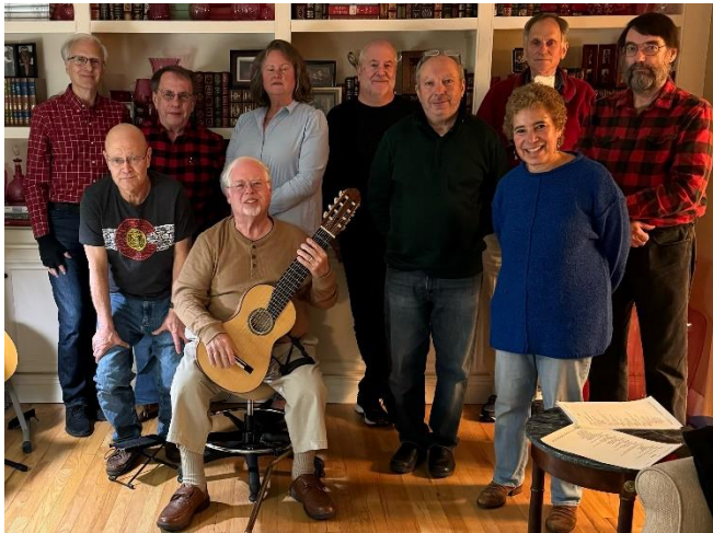
Photo from November 2023 meeting.