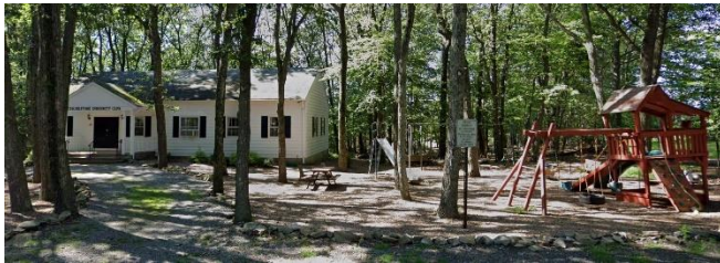
Puddingstone Community Club

Recordings of each Zoom meeting can be viewed on Zoom for a short time after the meeting. We will send links to the recording to members who joined the meeting, and any other member on request.