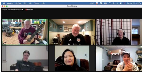
Photo from March meeting