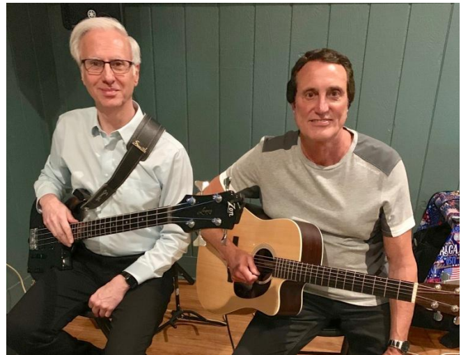
J & B Duo Performing at American Legion Post 57.