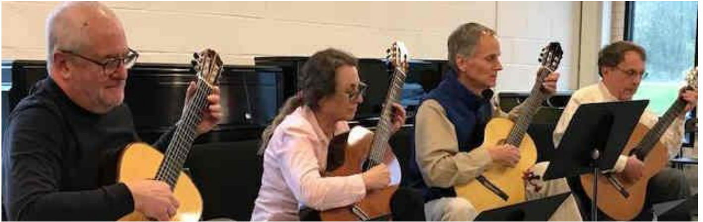
Hopewell Guitar Ensemble