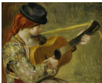
Girl With A Guitar by Pierre Auguste Renoir