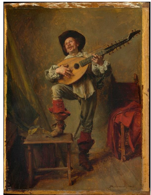
Soldier Playing the Theorbo, Ernest Meissonier